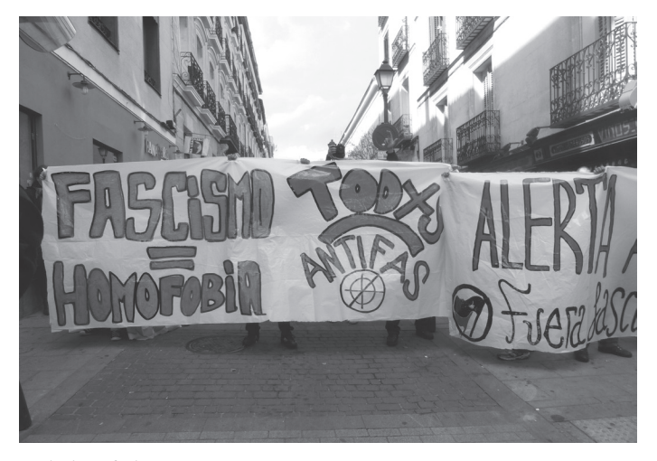
Madrid antifa demo May 1, 2013.

its successor formation, led the authorities to ban the group. Even when Dutch anti-fascists were badly beaten back by fascists from the Nationalistische Volks Beweging (NVB) on one occasion in 2007, the police intervened and arrested the fascists on weapons charges, which caused the group to turn in on itself and subsequently collapse.