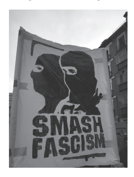
Banner at Madrid anti-fascist march against Hogar Social in May 2017.

The liberal alternative to militant anti-fascism is to have faith in the power of rational discourse, the police, and the institutions of government to prevent the ascension of a fascist regime. As we have established, this formula has failed on several notable occasions. Given the documented shortcomings of "liberal anti-fascism" and the failure of the allied strategy of appeasement leading up to World War II, a more convincing argument can be made that allowing fascism to develop and expand runs the documented risk of sliding into "totalitarianism." If we don't stop them when they are small, do we stop them when they are medium-sized, then when they are large? When they're in government? Do we need to wait until the swastikas are unfurled from government buildings before we defend ourselves?