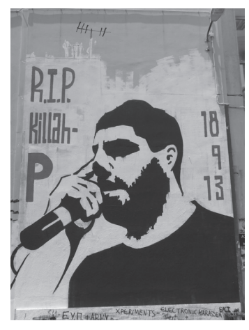
Mural for slain antifa rapper Pavlos Fyssas (Killah P) in Athens.

Matters grew more serious on September 18, 2013, when the anti-fascist rapper Pavlos Fyssas (Killah P) was stabbed to death by Golden Dawn members after he watched a football game at an Athens café. The murder sparked outrage across the country as anti-fascists shouting "Kill fascists in every neighborhood" clashed with police, while in the public sector a general strike was called. Anti-fascists targeted cash-for-gold shops particularly, because many of them were allegedly owned by Golden Dawn members with links to organized crime.<sup>282</sup>