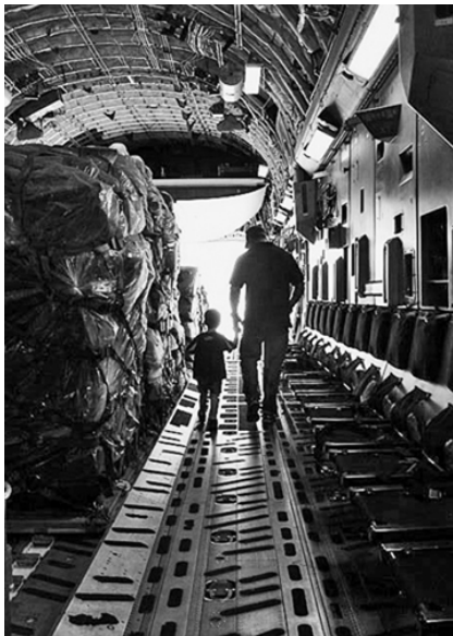
My son and I check out a C-17.