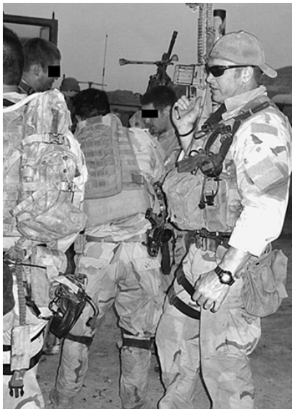
Here I am with the boys in '06, just back from an op with my Mk-11 sniper rifle in my right hand.