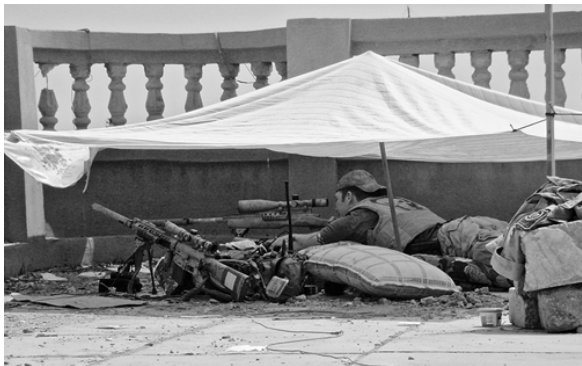
Set up on a roof in Ramadi. The tent provided me a bit of relief from the sun.