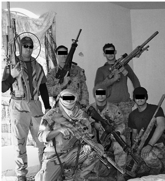
Fallujah in '04. Here I am with my .300 WinMag and some of the snipers I worked with. One was a SEAL, the others were Marines. (You can tell their service by the camis.)