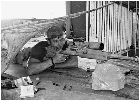
Another sniping position I used in the same battle.