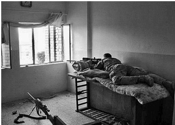
The sniper hide we used when covering the Marines staging for the assault on Fallujah. Note the baby crib turned on its side.