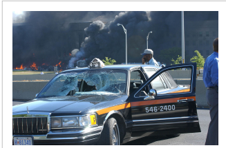
A Lincoln Town Car taxicab was hit by a lightpole as American Airlines Flight 77 passed over Washington Boulevard and crashed into the Pentagon.

9:37:46: Flight 77 crashes into the western side of the Pentagon at 530 mph (853 km/h, 237 m/s, or 460 knots) and starts a violent fire. The section of the Pentagon hit consists mainly of newly renovated, unoccupied offices. All 64 people on board are killed, as are 125 Pentagon personnel.