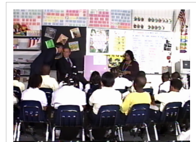
George W. Bush being told by his Chief of Staff Andrew Card about the second plane hitting the WTC

9:05: After brief introductions to the Booker elementary students, President Bush is about to begin reading The Pet Goat with the students when Chief of Staff Andrew Card interrupts to whisper to the president, "A second plane has hit the second tower. America is under attack." [7] The president stated later that he decided to continue the lesson rather than alarm the students.