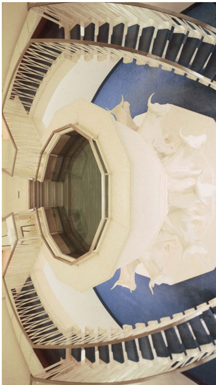
Baptistal Font, Washington D.C. Temple