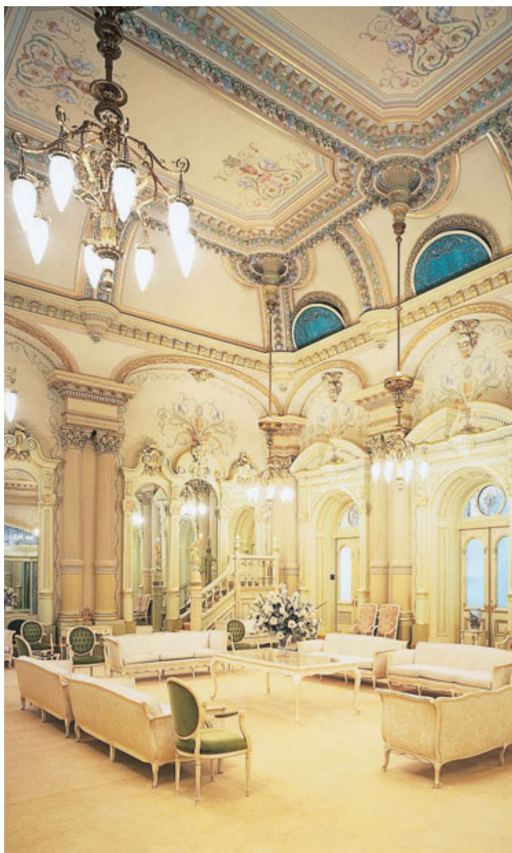
Celestial Room, Salt Lake Temple