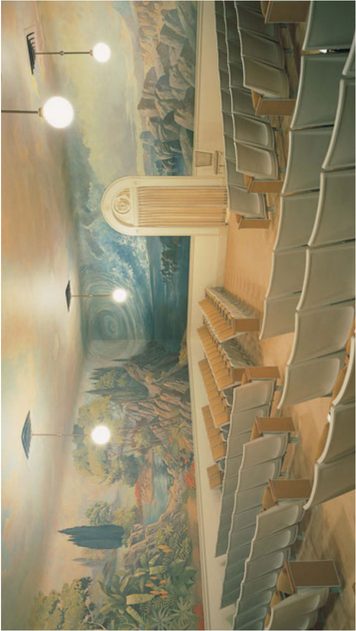
Creation Room, Salt Lake Temple