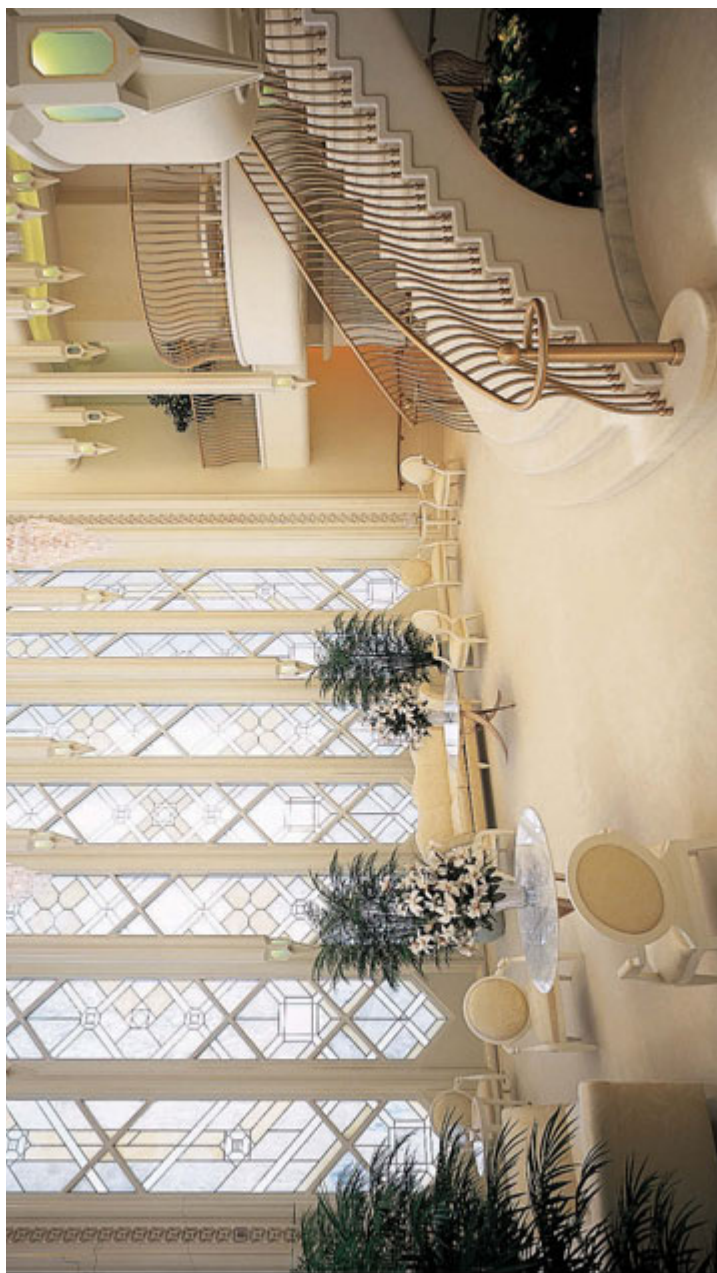
Celestial Room, San Diego California Temple