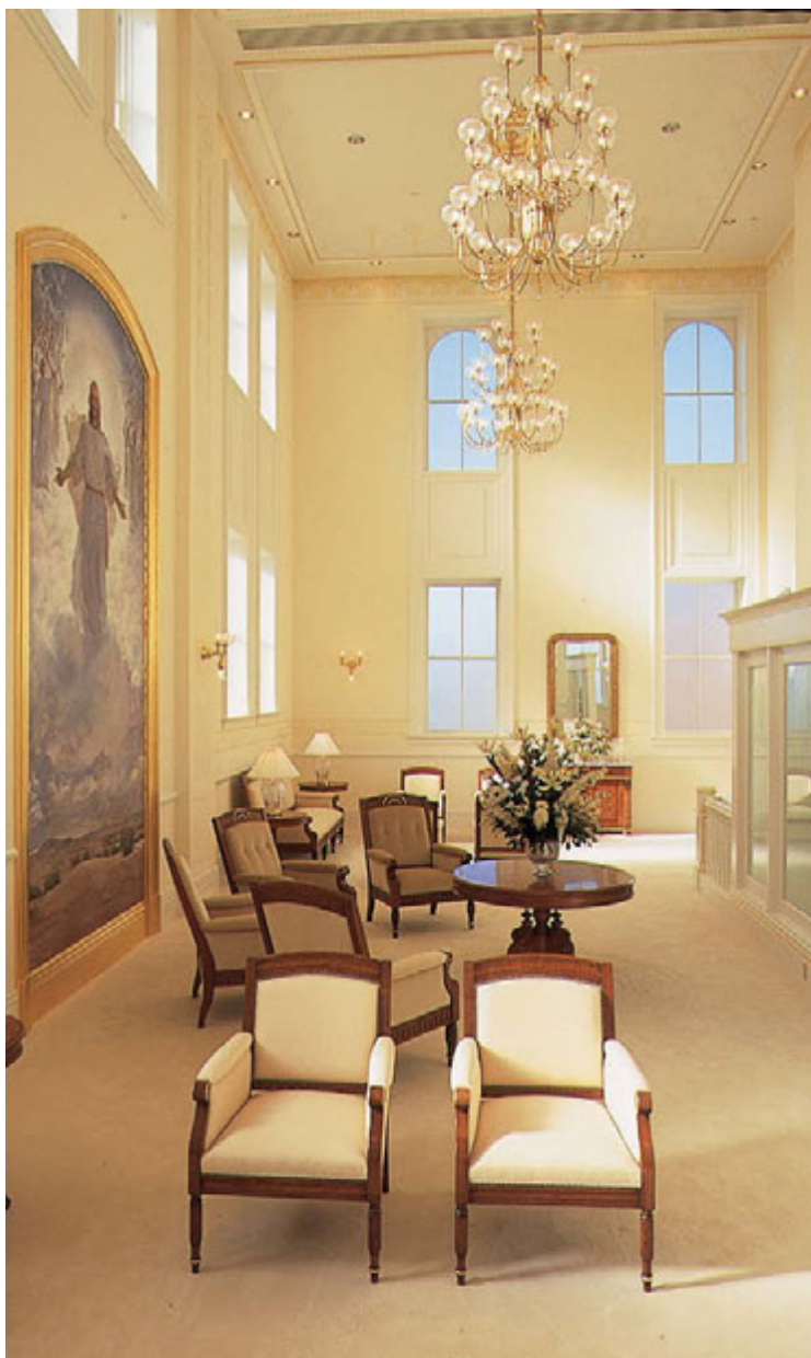
Celestial Room, Vernal Utah Temple