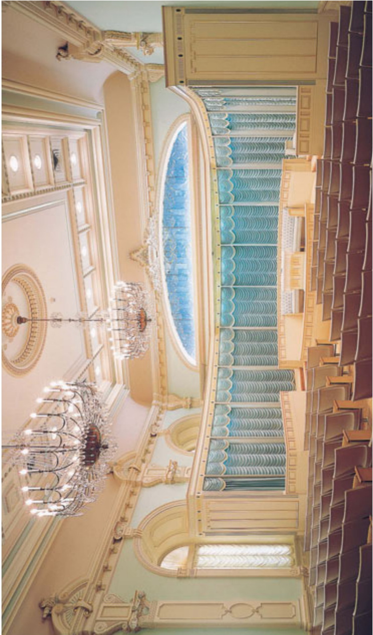
Terrestrial Room, Salt Lake Temple