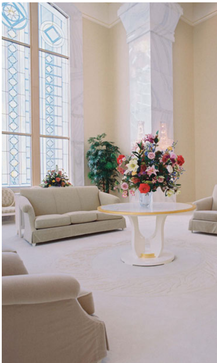
Celestial Room, Columbia River Washington Temple