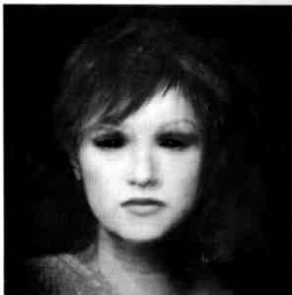
Image: A soft-looking woman in her 40s, Robin did not have much time for the gym or beauty salons when she was alive. From a certain perspective, she looks very much like a middle-class mother of three. She uses this disarming appearance along with a pleasant, matter-of-fact attitude to win over potential allies and make enemies underestimate her. In truth, she has a killer instinct, and — as her court record shows — she knows how to win.

Her ambitions do not extend beyond those of her sire. She sees Bilé's scheme as brilliant, and she plans to play her part in it as best she can. She'll follow his lead and earn the comfortable benefits thereafter. As long as she believes that her sire offers the best chance for achieving wealth, she will follow him wherever he directs her. Should he ever betray her trust, she would have no qualms about turning against him. As for her "brother" Michael, she holds him in slight regard. He is but a pawn who's useful but ultimately disposable.