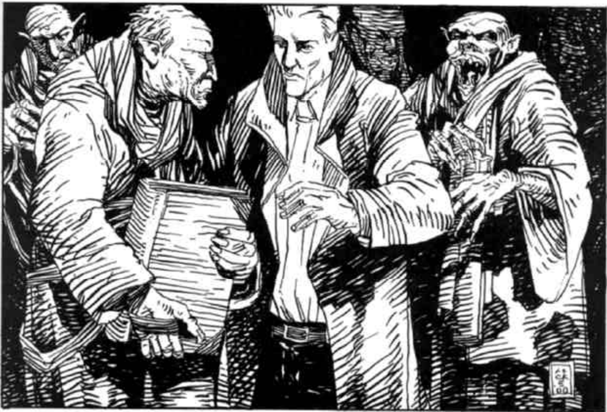
CHAPTER TWO: THE KING IS DEAD, LONG LIVE THE KING

Often, but not always, Ventrue come into unlife with some resources of their own. However, while a two-story house and four-car garage may impress the guys at work,